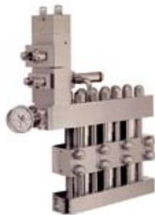
Rannie three-piece valve housing

Designed to simplify routine maintenance. Materials for plungers, packings, pump valves, valve seats and seals are custom-selected for your application. APV engineers will work with you to optimize the configuration for your specific application.