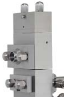
Rannie three-piece valve housing

Design features of both the Rannie and Gaulin simplify routine maintenance. Materials for plungers, packings, pump valves, valve seats and seals are custom-selected for your application. APV engineers will work with you to optimize the configuration for your specific application.