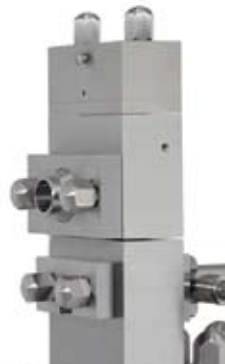
Rannie three-piece valve housing

The Rannie 15 / Gaulin 15 homogenizer, a positive displacement triplex, reciprocating plunger pump, is fitted with an application-specific homogenizing valve assembly: single-stage with manual actuation. As a high-pressure pump, this unit can be fitted with a relief valve.