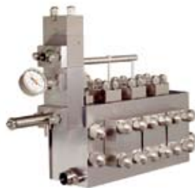
Gaulin mono-block design

The Rannie 15 / Gaulin 15 homogenizer incorporates a durable slow-speed power end that reduces vibration and noise. Easy access to the lubrication oil and other auxiliary systems simplifies maintenance saving time and money. Liquid end options include a three-piece valve housing (Rannie) and a mono-block design (Gaulin) (ball and poppet style). As a standard the homogenizer is equipped with a Stellite XFD homogenizing valve.